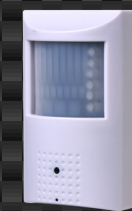
Covert motion sensor camera