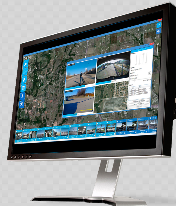
Command & Control Center Dashboard

Statistical data overlaid onto a map for visual analysis. Detailed auto-generated reports are available