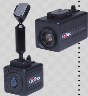
High definition front cameras

Protect your department, your officers, and their integrity