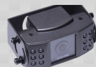
Rear IR cameras