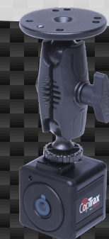
Wall-mounted HD camera